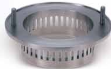
Slotted disintegrating head