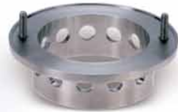
General purpose disintegrating head

The machines are in most cases self-cleaning, a short run between successive operations in water, detergent or an appropriate solvent being all that is necessary. For more thorough cleaning, dismantling is easy and downtime minimal.