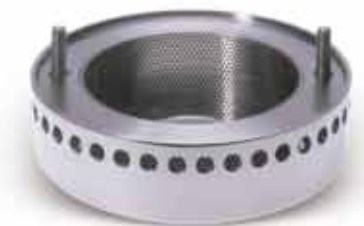
Standard emulsor head and emulsor screen