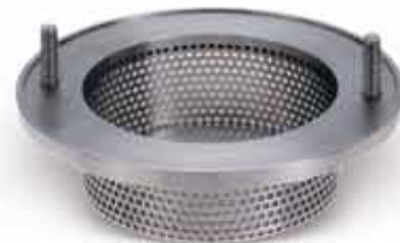
Square hole high shear screen™